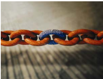
People are the Weakest Link!

infotex offers other training presentations for the various levels in your organization. The presentations are customized to your exact needs.